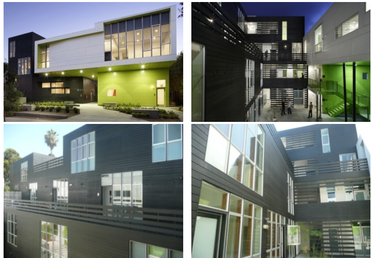
Completed project with 6" cedar siding over Black WallShield