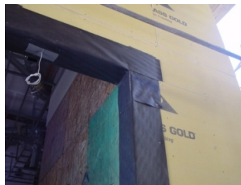
VaproFlashing ™ Black corners and window flashing application