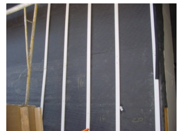
VaproBatten ™ over Black WallShield