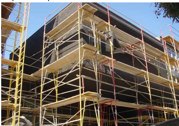
Installation of Black WallShield

They used a double layer of Black WallShield per the details and specifications. The success of the installation has led to Archetype committing to three additional large condominium projects with VaproShield products.